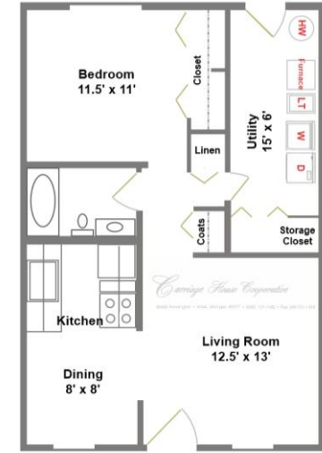
One Bedroom One Bath 600 sq. ft. $420 per month